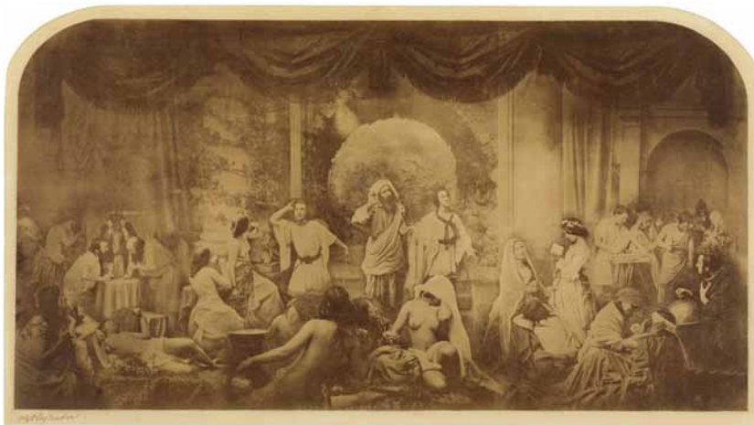
IMAGE 1. The Two Ways of Life (Hope in Repentance) (1857) by Oscar Reijlander.

Reijlander's magnum opus, The Two Ways of Life (Hope in Repentance) (1857), caused a stir when it was displayed that year in The Art Treasures of Great Britain , a show that went on to attract more than 1.3 million visitors. It brought him fame and infamy. The tour de force of combination printing, composed of more than thirty negatives, presents an allegory of two young men choosing between the paths of vice (depicted by men gambling and a bevy of barely clad female beauties lolling and twisting seductively) and virtue (represented on the right by men at work or study and a modestly dressed young woman reading). For the most part, critics and professional photographers deemed it a masterwork, but the public was scandalized, perhaps because the nudes were flesh-and-blood women caught by the photographer's lens, not products of a painter's imagination.